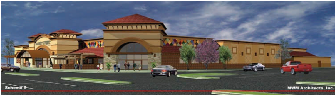
United Market Street SEC 98th Street & Quaker Ave, Lubbock, Texas (completed December 2006)