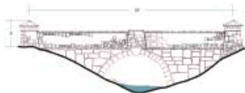
Signature Stone Bridge